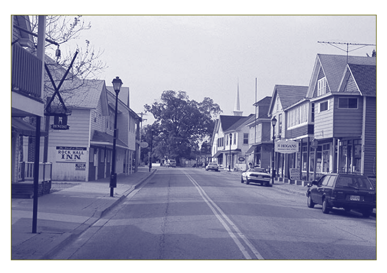
The Byway as it passes through Rock Hall's town center.

• During the next decade people will become increasingly time-sensitive. In addition, the continuation of two income households will mean less scheduling flexibility and less time off with pay. The resulting time constraints will translate to more, shorter trips and more trips closer to home. This will be an advantage for Upper Shore communities, which are easily accessible to large metropolitan area populations.