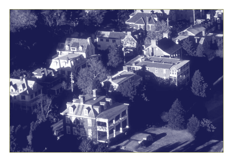
The Byway passes through Chestertown's National Historic Landmark District.

to similarly-situated roads and resources in the region.