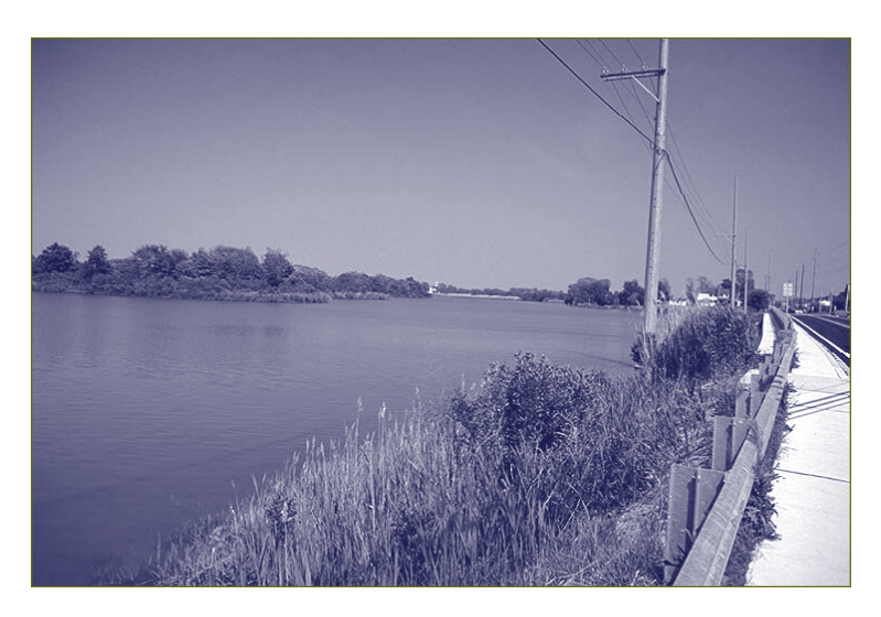
Waterviews at Cox Creek west of Stevensville.

Centreville. Centreville has a strong, visually appealing town core comprised of historic brick architecture and a historic town square and courthouse. The two one-way routes running through town provide different experiences when traveling the Byway in opposite directions. Both routes are lined