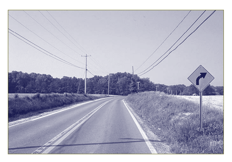
View along MD Route 18 north of Queenstown.

crossroads, a small settlement of houses one deep along the Byway.