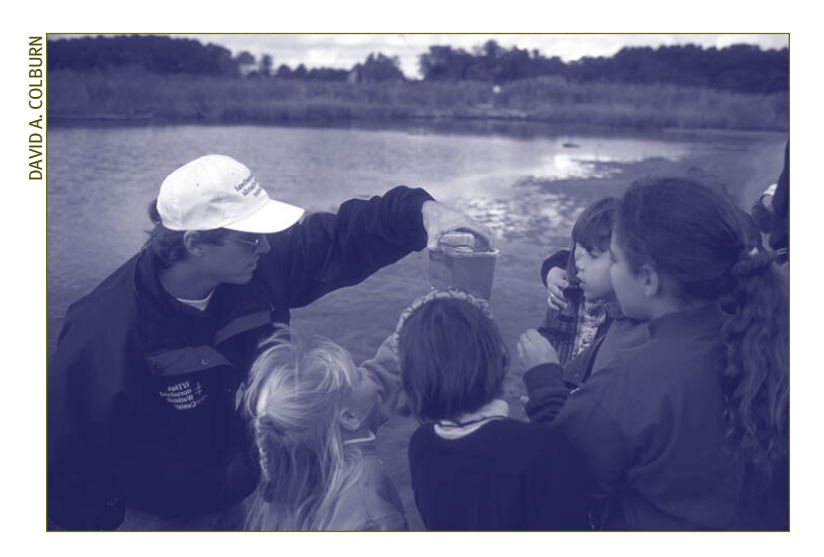
Echo Hill and the Horsehead Wetlands Center serve as regional centers for environmental education.

sandy beaches, marshlands and tidal ponds. The area includes a variety of wildlife including deer, beaver, muskrat, raccoon, squirrel, woodchuck, and chipmunk. In addition to the many birds, the Sassafras River area is a nesting site for the Bald Eagle.