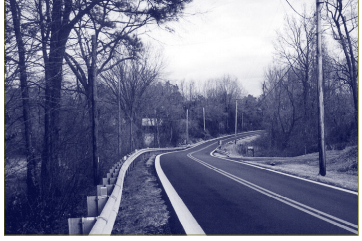
Illustration of geometric and shoulder improvements along MD Route 18 north of Queenstown.

segments along MD Route 445 from Rock Hall to Eastern Neck Island and along MD Route 18 between MD Route 213 and US 301. According to accepted sources (the Manual of Uniform Traffic Control Devices) bringing these sections up to standards would require the construction of four to five foot wide shoulders with appropriate markings and striping. For all segments, lane markings, route identification signs, and warning signs should also be required, consistent with state and federal regulations.