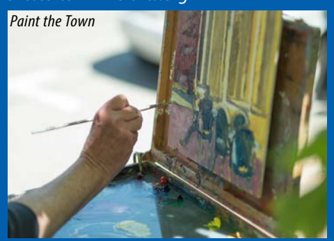
MAY Galena Dogwood Festival kentcounty.com/events/annual

APRIL Paint The Town chestertownriverarts.org