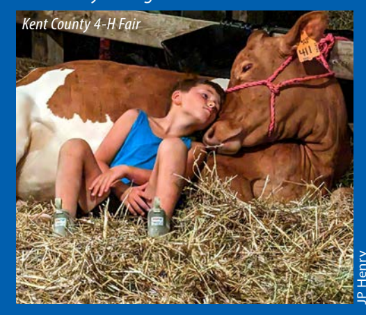
AUGUST Betterton Appreciation Day kentcounty.com/events/annual