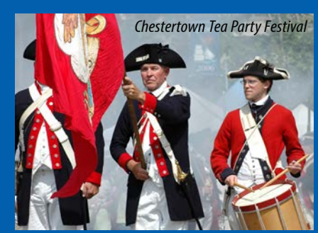
Chestertown Tea Party Festival chestertownteaparty.org

JUNE National Music Festival nationalmusic.us